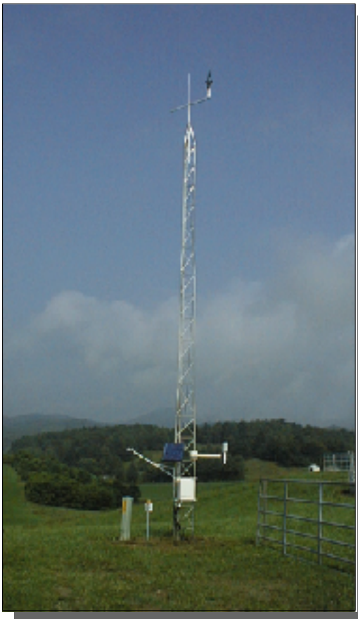
NC ECONet stations monitor soil moisture and soil temperature at each of the 24 SCO sites, as well as other parameters critical for agriculture.

Current efforts are focusing on the estimation and impacts of soil temperature and soil moisture on local weather and environmental conditions.